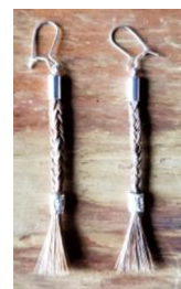
Straight with Tassels at Ends